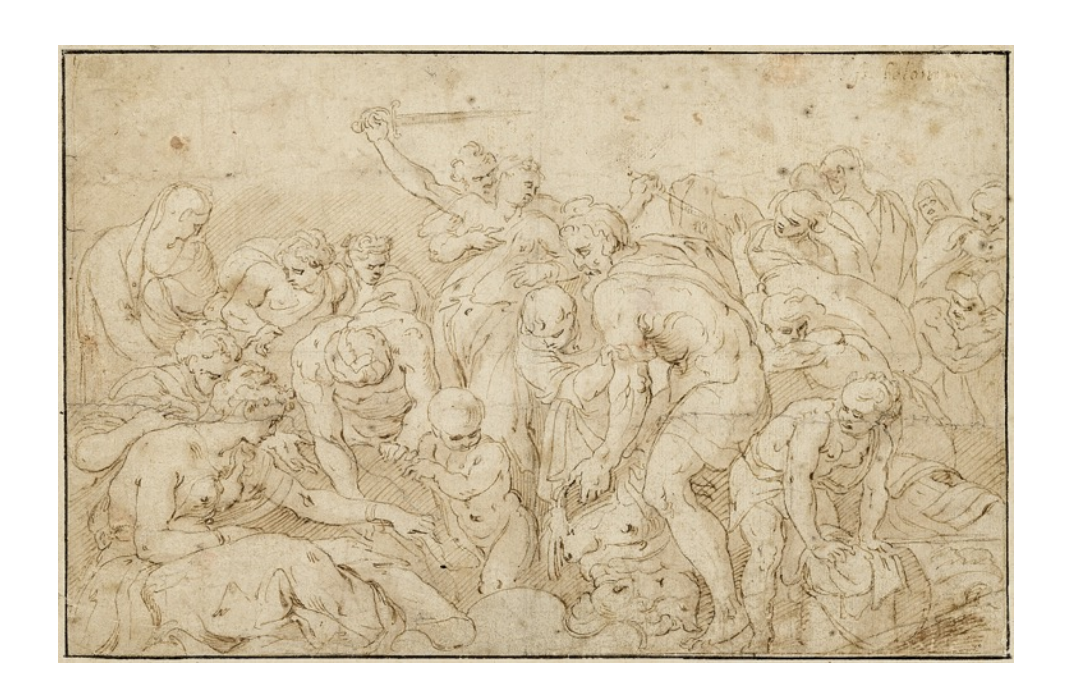
21. Northern mannerist artist (active ca. 1565) The Discovery of Achilles amongst the daughters of Lycomedes pen and sepia ink 155 x 235 mm

Though the author of this fine drawing cannot be identified with certainty, it can safely be dated to the second half of the sixteenth century (around 1560). The drawing is a contemporary copy after a painting by the Italian-born painter Francesco Primaticcio (Bologna 1504 - 1570), one of the leading artists of the so-called First School of Fontainebleau. It can be assumed on stylistic grounds, that the author was a visiting northern mannerist artist.